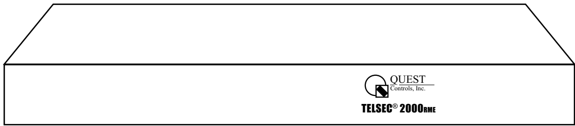
TELSEC® 2000RME (FRONT VIEW)