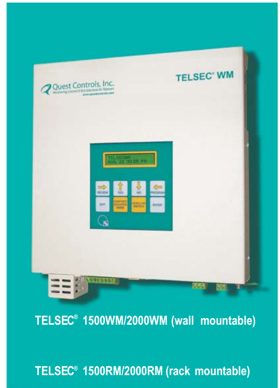
TELSEC® 1500WM/2000WM (wall mountable)