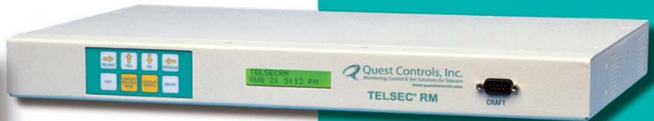
TELSEC® 1500RM/2000RM (rack mountable)

Web Browser for status and configuration